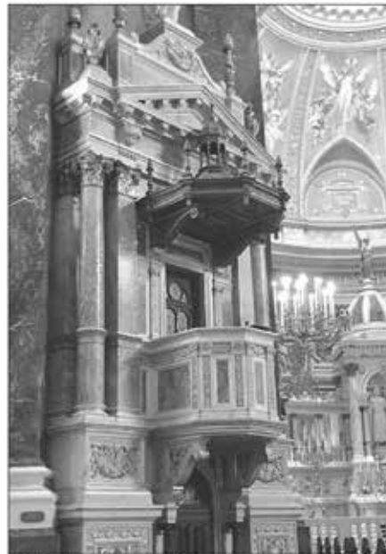
St. Stephen's Basilica in Budapest