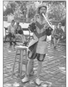
Entertainment in Esztergom